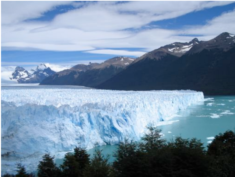
Image of Patagonia (10)

Spanish colonizers arrived in present-day Argentina in the early 1500s. In 1816, the Provinces of the Rio Plata declared their independence from Spain. Argentina (from the Latin, Argentum ) was the land mass that remained after Bolivia, Paraguay and Uruguay decided to pursue their own independence. The newly-formed country experienced their prime immigration period from 1860 to 1930 and was predominantly from two countries: Italy and Spain.