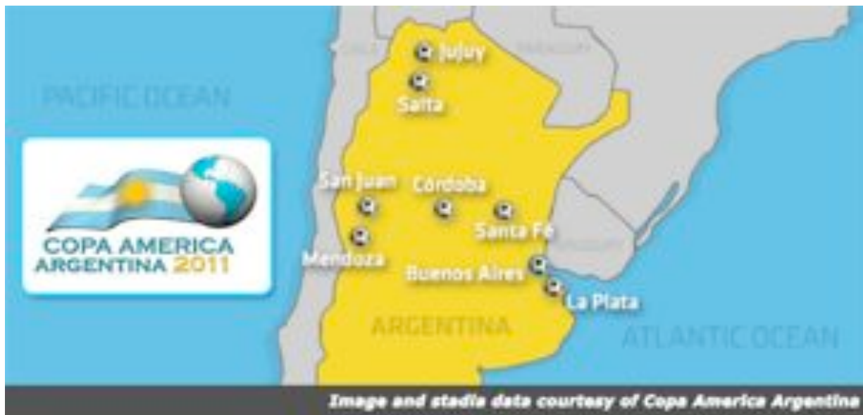
Image and stadium data courtesy of Copa America Argentina 2011. (3)