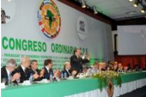
Dr. Nicolas Leoz, the President of CONMEBOL.

Ten members from CONMEBOL, which is the South American football confederation: