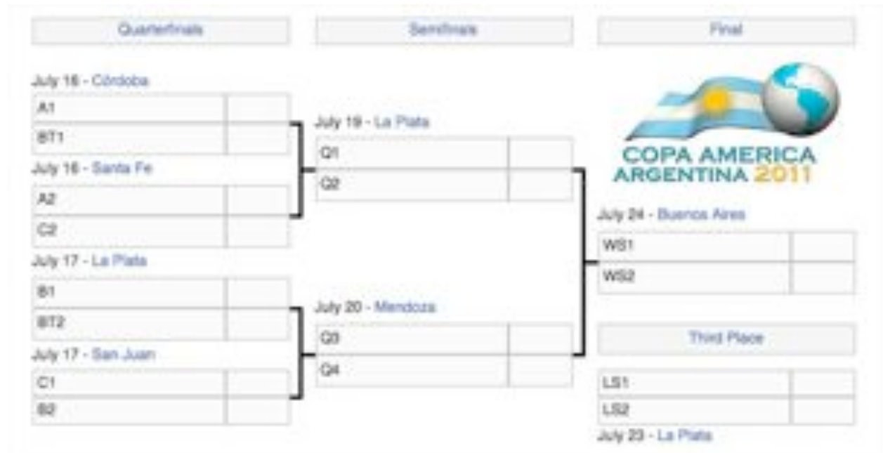
Chart source: (7)

Please Note: The first two teams in each group, along with the two best third place teams, will qualify for the elimination round. There will be 30 minutes of extra time and then spot kicks to determine the winner. (6)